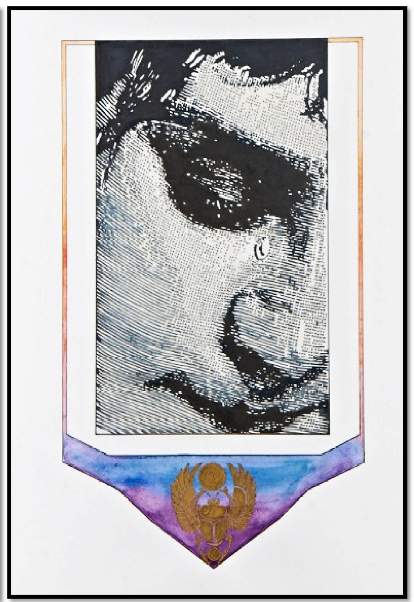
"We were slaves unto Pharaoh in Egypt" Moran Hynal (Munich, Germany)